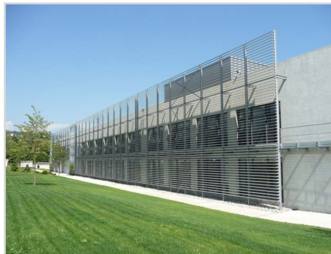
Techni Architecture succeeded in combining modernity with timelessness in this factory for the perfume maker Robertet in Grasse.