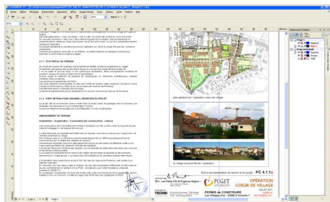
A page from a building permit, combining site photos, plans, text and images imported from other programs with the project information – all assembled in CorelDRAW®.

An additional challenge for many architects is that this documentation is created and stored in different formats – CAD-CAM for plans, image formats for the photos and office files for the text and pricing documents. Pascal Costamagna has solved this issue by using CorelDRAW® Graphics Suite as a central hub to manage the various document types and formats. "I've been using CorelDRAW® since version 9," he