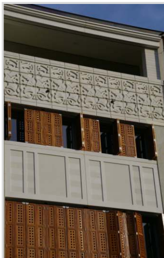
The town hall in Canet, another of Techni Architecture's designs.