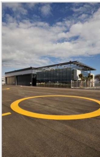
Helicopter base at Cannes, designed by Techni Architecture.