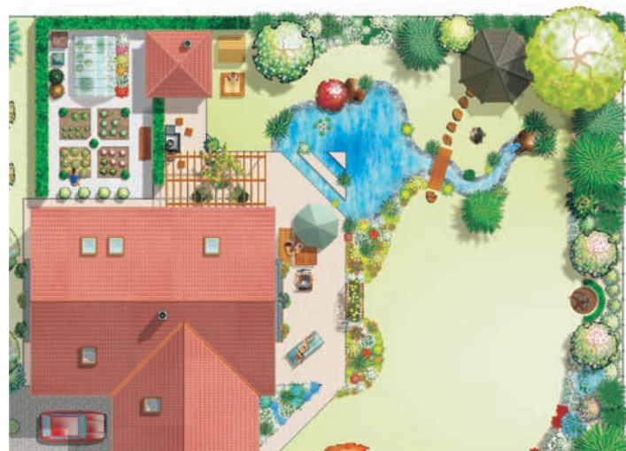
Fig. 1: Projection view of a garden design created in CorelDRAW