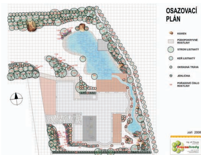
Fig. 3: Project based on technical drawings.