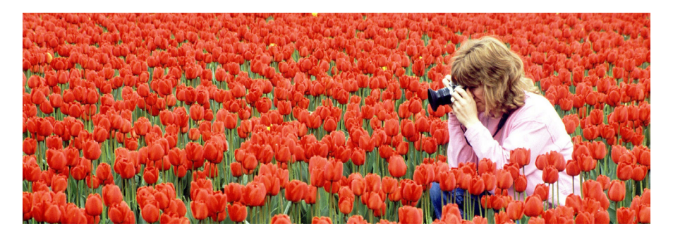
Photo hobbyists are serious about taking pictures and often carry their camera with them at all times. They're ready to capture photo opportunities in every situation and they want simple tools that enable them to enhance their photos and inject their own personal touches. Photo hobbyists like to experiment with new technologies and techniques, and appreciate the ability to undo or redo an unlimited number of steps. Paint Shop Pro X provides photographers of all skill and experience levels with tools that balance the efficiency of quick fixes with the power of precision photo editing controls.