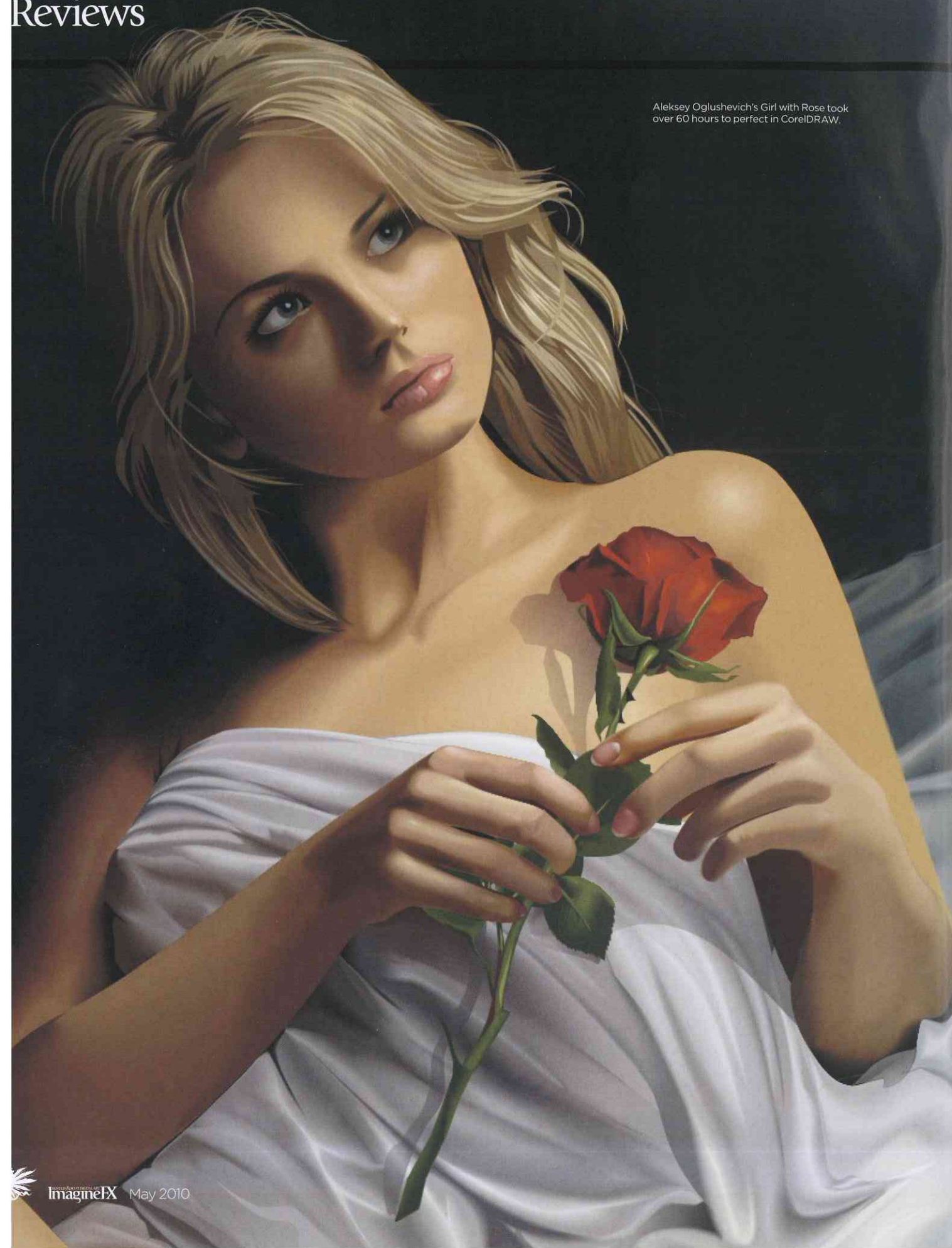
Aleksey Oglushevich's Girl with Rose took over 60 hours to perfect in CorelDRAW.