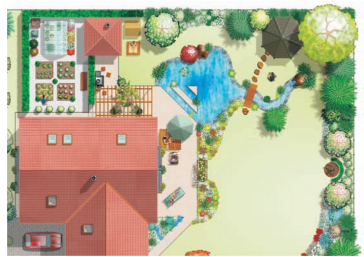
Fig. 1: Projection view of a garden design created in CorelDRAW

Name: Jiřího Prouzy Company: Prouza-zahrady Location: Prague, Czech Republic Industry: Gardening and landscape designs Product: CorelDRAW® Graphics Suite