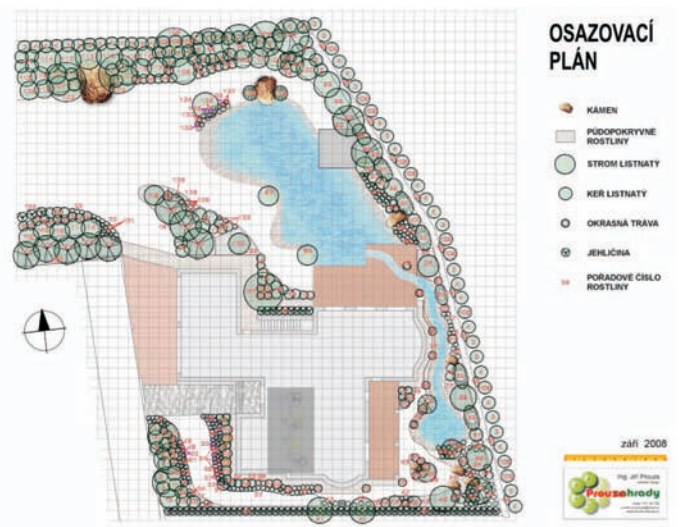
Fig. 3: Project based on technical drawings.